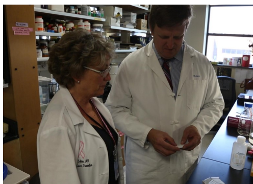
Komen Promise Grantees at the University of Kansas and the University of North Carolina tested flaxseed for the prevention of breast cancer.